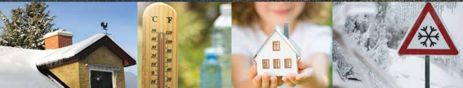
SENTINEL SLATE AVAILABLE IN SELECT MARKETS

Can't decide on a shingle color? IKO ROOFViewer ® to the rescue!