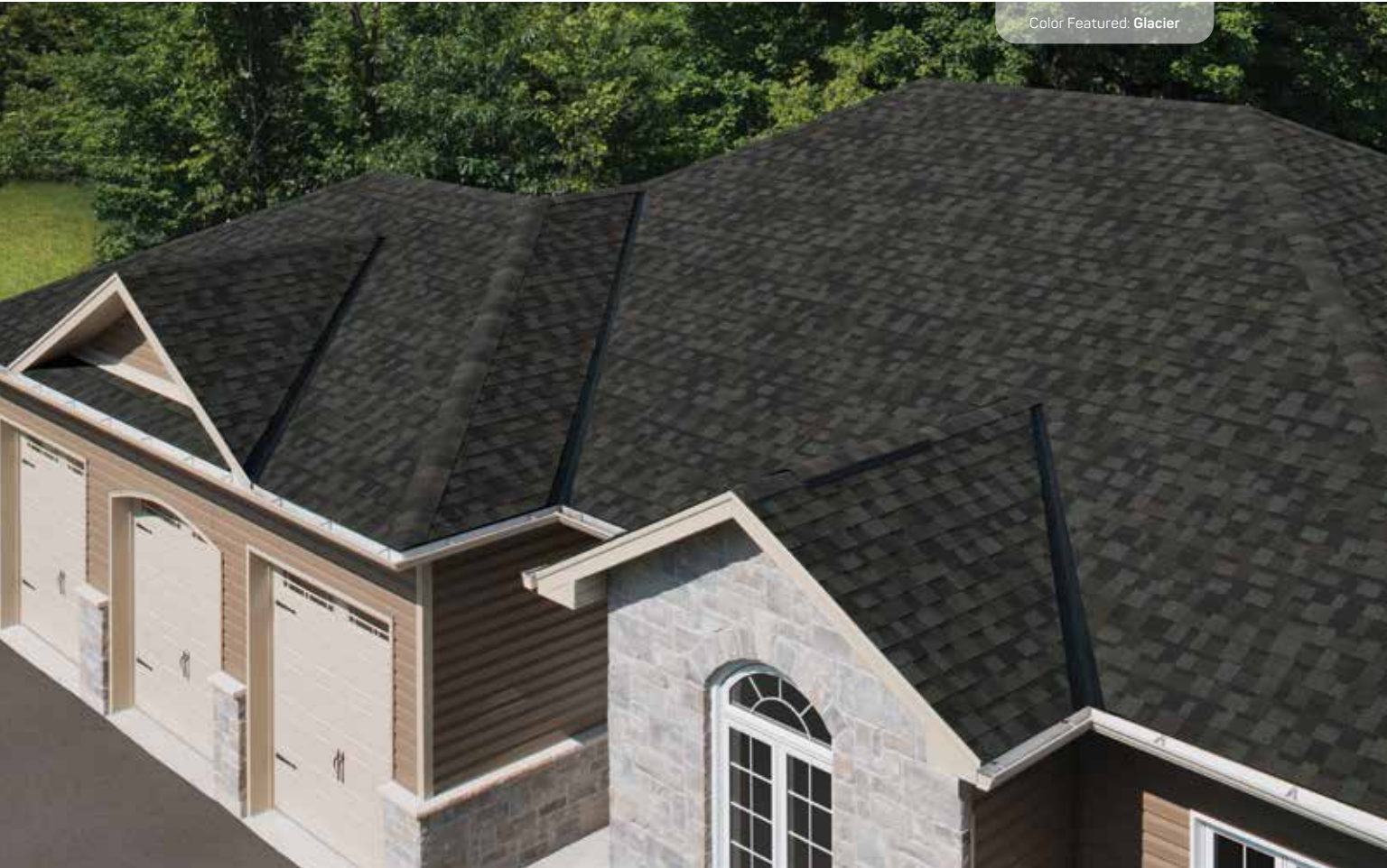
Color Featured: Glacier

Our color blends are all high-definition, with deep shadow bands and color gradations that combine to create texture and visual appeal. Don't be surprised when people ask what kind of shingles are on your home.